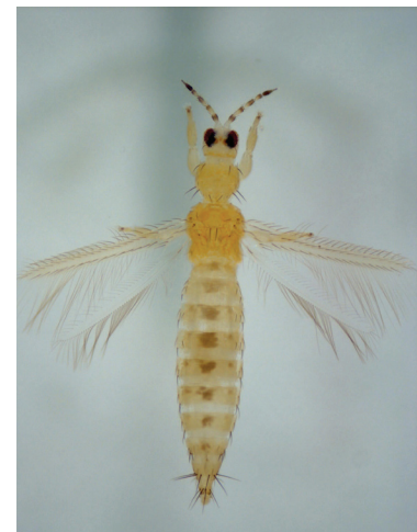
Adult western flower thrips. 1

Nemasys quickly controls larval stages of fungus gnats ( Bradysia spp.), and the adult and pupal stages of western flower thrips ( Frankliniella occidentalis ). When applied to the soil, Nemasys will provide prolonged protection against pest re-infestation. Nemasys is ideally suited for use in integrated pest management programs as an important tool for resistance management, worker safety and environmental responsibility.