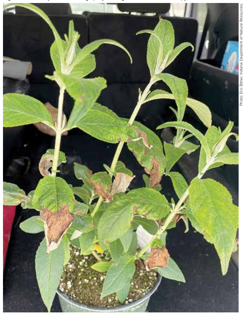
Figure 3. Butterfly bush showing spray damage limited to mid-canopy.