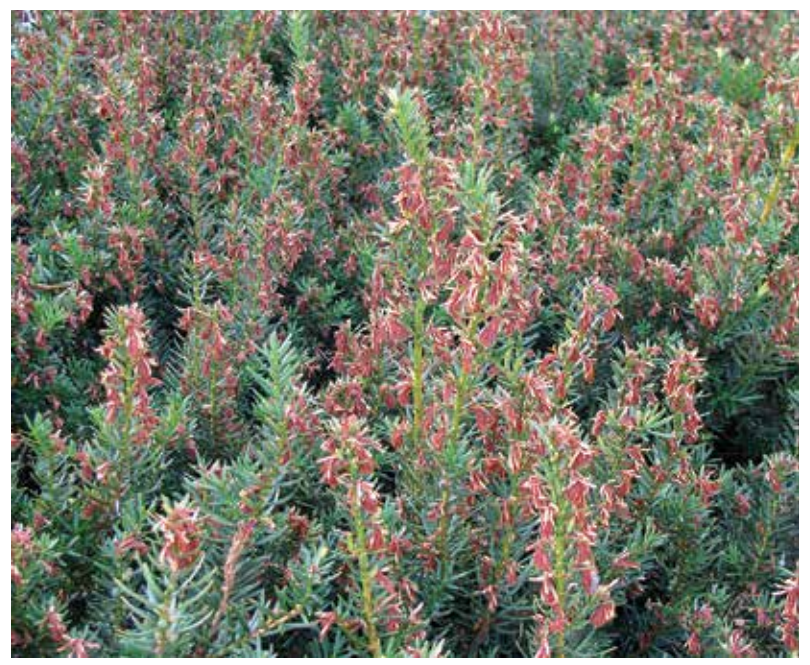
Figure 2. Frost damage on new growth of yew showing a uniform pattern.