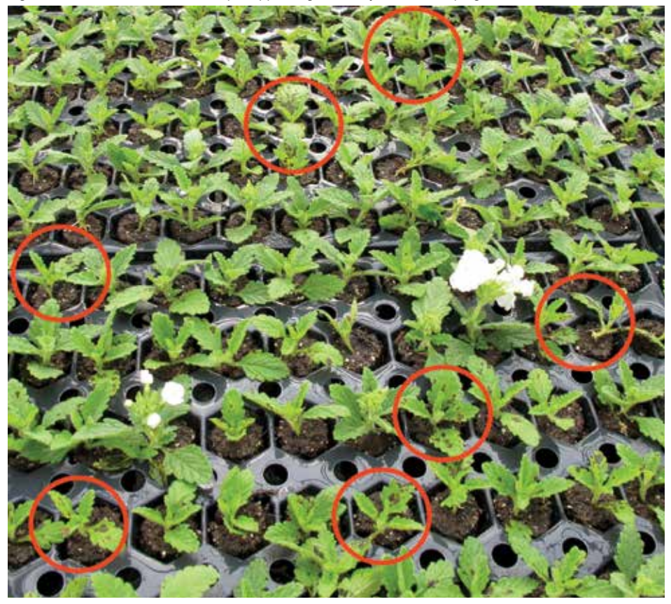
Figure 1. Acidovorax bacterial leaf spot appearing randomly on verbena plugs.