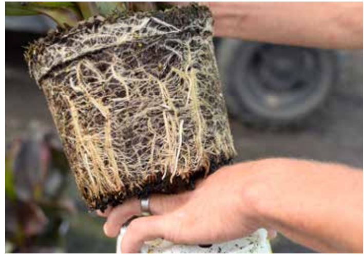
Healthy roots treated with Pageant Intrinsic brand fungicide.