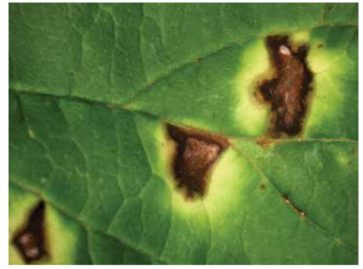
Figure 4. Bacterial leaf spot on viburnum showing angular leaf spots with yellow margins.