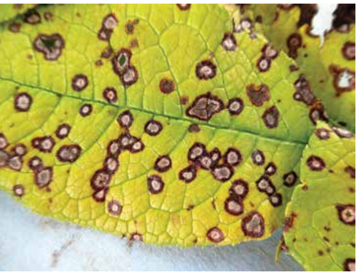
Figure 7. Cercospora leaf spot on holly.