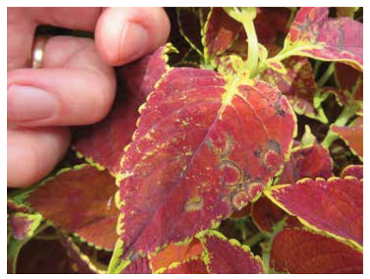
Figure 8. Impatiens Necrotic Spot Virus symptoms on coleus.