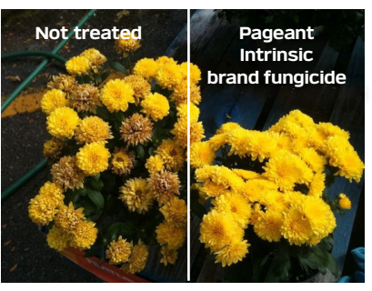
Image on the right shows increased shelf life compared to untreated plants.