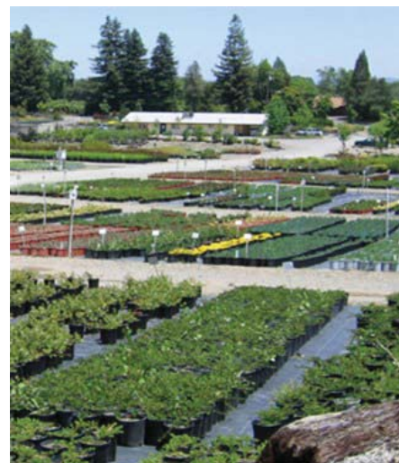
Containerized nursery plants grown outside the greenhouse environment have the potential for IFA infestation.

Certificates authorizing movement of regulated articles are issued by quarantine officials when certain approved procedures have been utilized to ensure that the regulated article(s) are free from IFA infestation. See page 18 for a complete listing of State plant regulatory officials and USDA State Plant Health Directors.